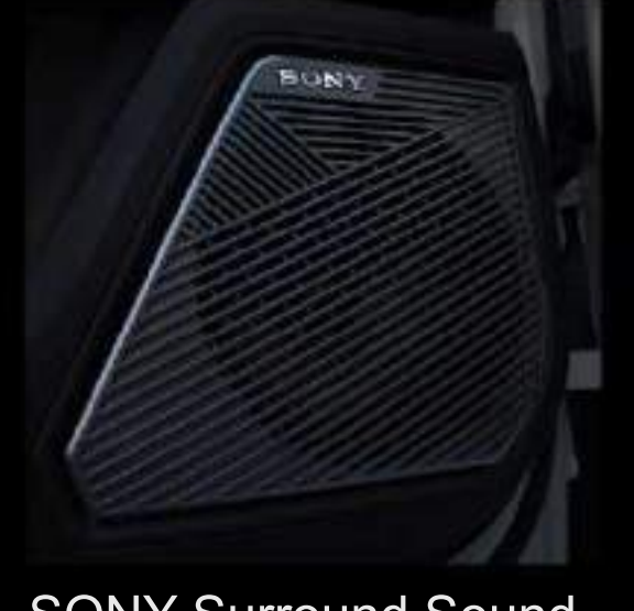
SONY Surround Sound 540° Camera System

A seamless blend of style and performance with the Avantgarde Fighter-inspired Transmission Shift.