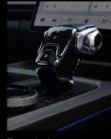
Futuristic SONY S Transmission Shifter System

Effortless power at your fingertips, redefining convenience and efficiency for your devices