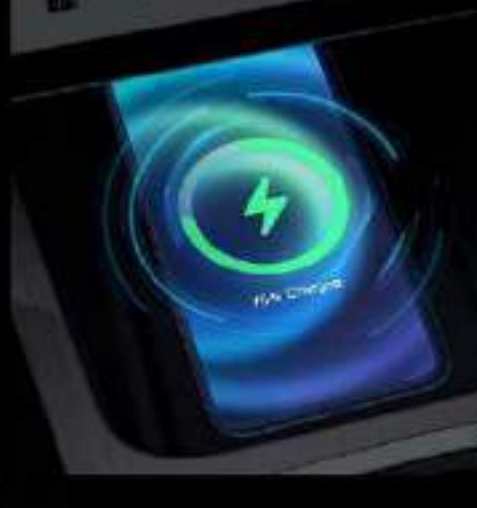
50W Air-cooled Wireless Charger

Effortless power at your fingertips, redefining convenience and efficiency for your devices